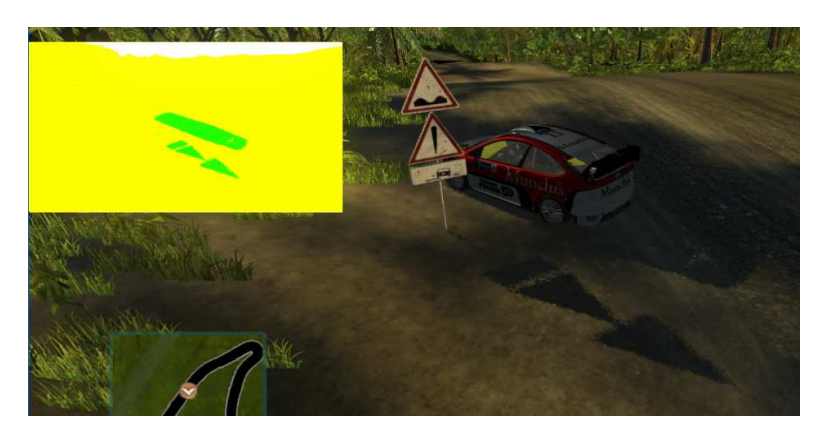
Dynamic Shadow Calculation